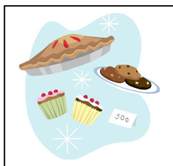
Goodie Sale Wednesday Feb. 18th

Goodie sales are held after school in front of the office on the third Wednesday of each month. The next one will take place on February 18 th at 1:50pm. Items for sale typically range in price from 25 to 50 cents, though we are preparing to offer Cabrillo Cubwear – T-shirts and such at their usual prices as well.